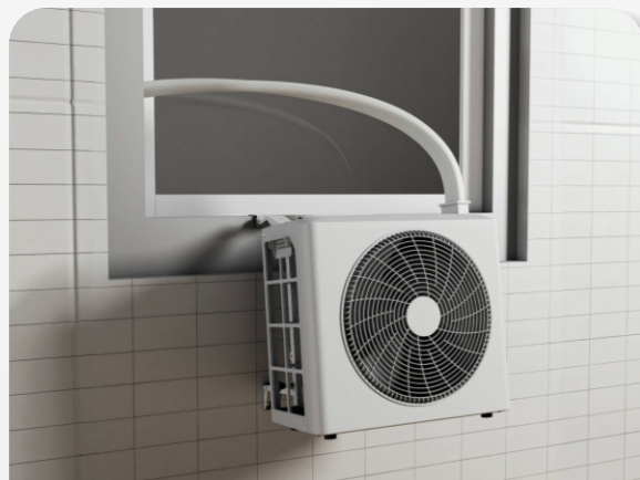
Sliding Window (Outdoor Unit)