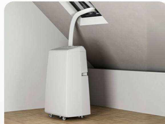
Roof Window (Indoor Unit)