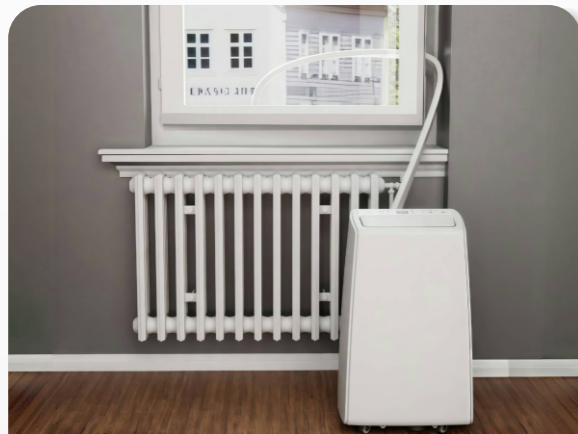
Sliding Window (Indoor Unit)