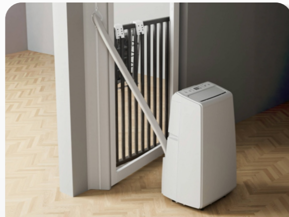
French Balcony (Indoor Unit)