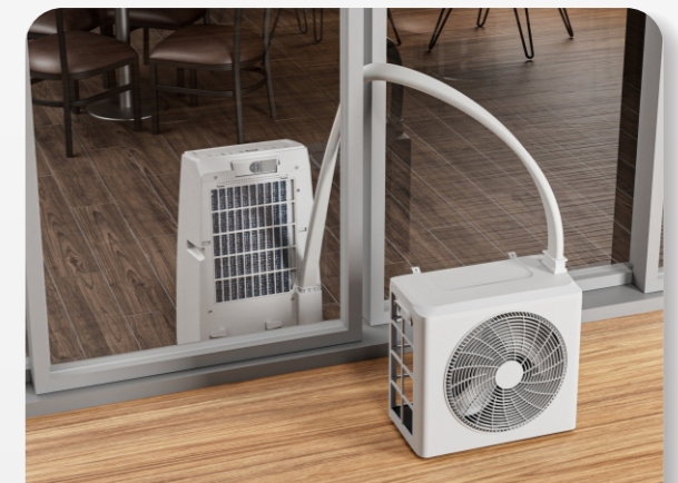
Sliding Door (Outdoor Unit)