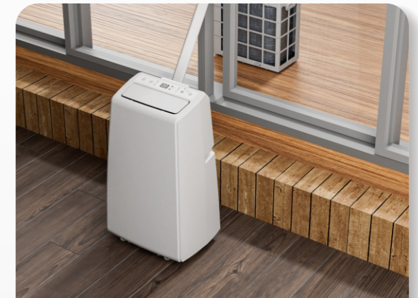
Sliding Door (Indoor Unit)