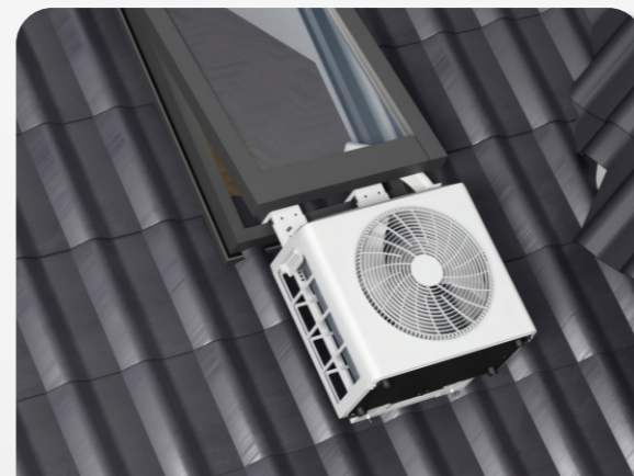
Roof Window (Outdoor Unit)